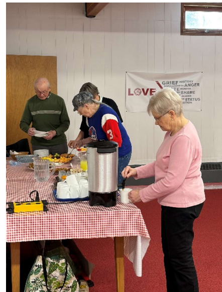
Submitted by Dolores Hall