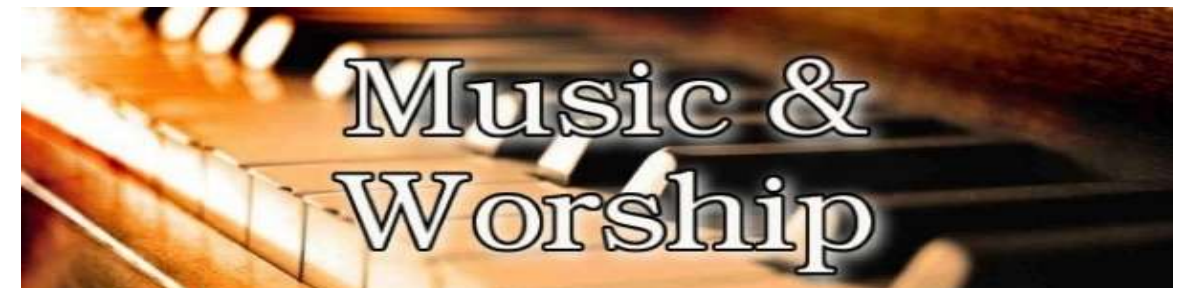
Music and Worship Copyright Licenses

Barnabas was not numbered among the twelve apostles, but the book of Acts gives him that title. After Paul was converted to Christianity, Barnabas welcomed him to Jerusalem, and later the two traveled together on missionary journeys.